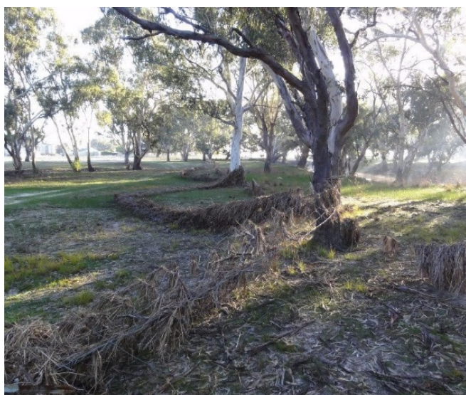
Riparian fence damaged by 2011 flood, Wimmera River

While it is not feasible to design fences to withstand the force of every flood, the guidelines aim to assist in minimising the risks of flood damage to fences and increase infrastructure longevity.