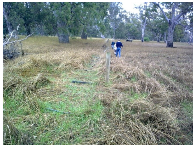
Strained fence length in drop down position