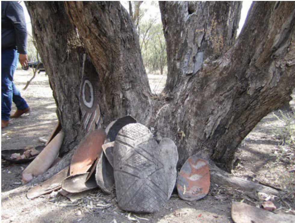
Figure 15: Culturally significant artefacts

Special memories, physical, spiritual and cultural connections are borne out of lived experiences on and around the water and waterways. Memories of Traditional Owner's grandfathers burning bark and placing in the river to draw fish to the area in the then clear waters were shared.