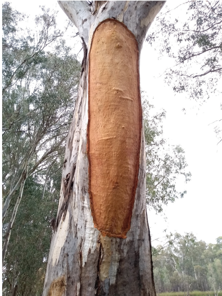
Figure 4: History in the making: scar tree created at Reedy Lagoon, Gunbower Island, at the 2018 Bark Canoe Event

Different people specialised in making tools for Barapa Barapa, and there was a big trading route. For Barapa Barapa to make their specialised tools, cultural implements and canoes, there needs to be water in certain places, at certain times, to enable plant and species to thrive in a way that supported the Nation.