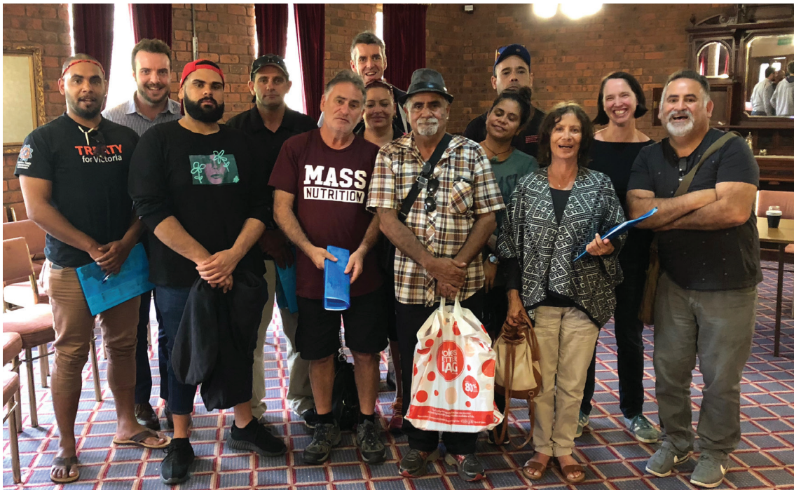
Figure 17: Members of Weki Weki and DELWP staff at Nation Meeting in December 2018, Tooleybuc.

We cannot leave it up to Government to look after cultural flows as they are easily corrupted to those who pay dollars for the election.