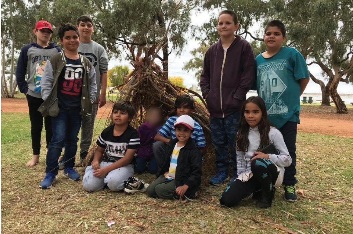
Figure 7: Water for the future: Lake Cullulleraine community gathering for the First Peoples of the Millewa-Mallee