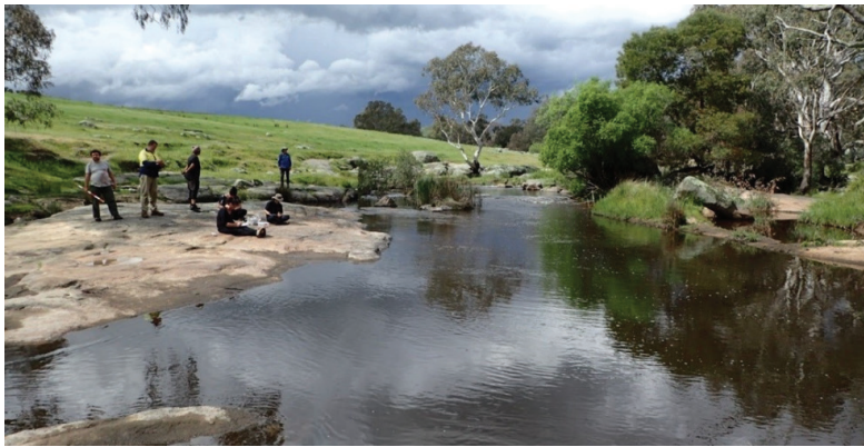
Figure 11: Taungurung Buk during AWA at Tarcombe – Hughes Creek