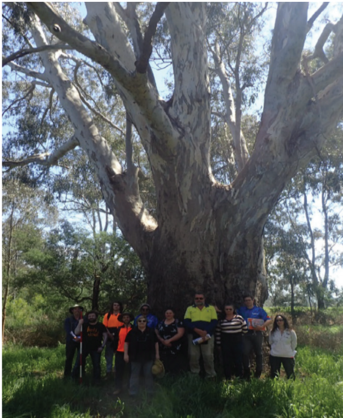
Figure 10: Taungurung Buk during the Aboriginal Waterway Assessment