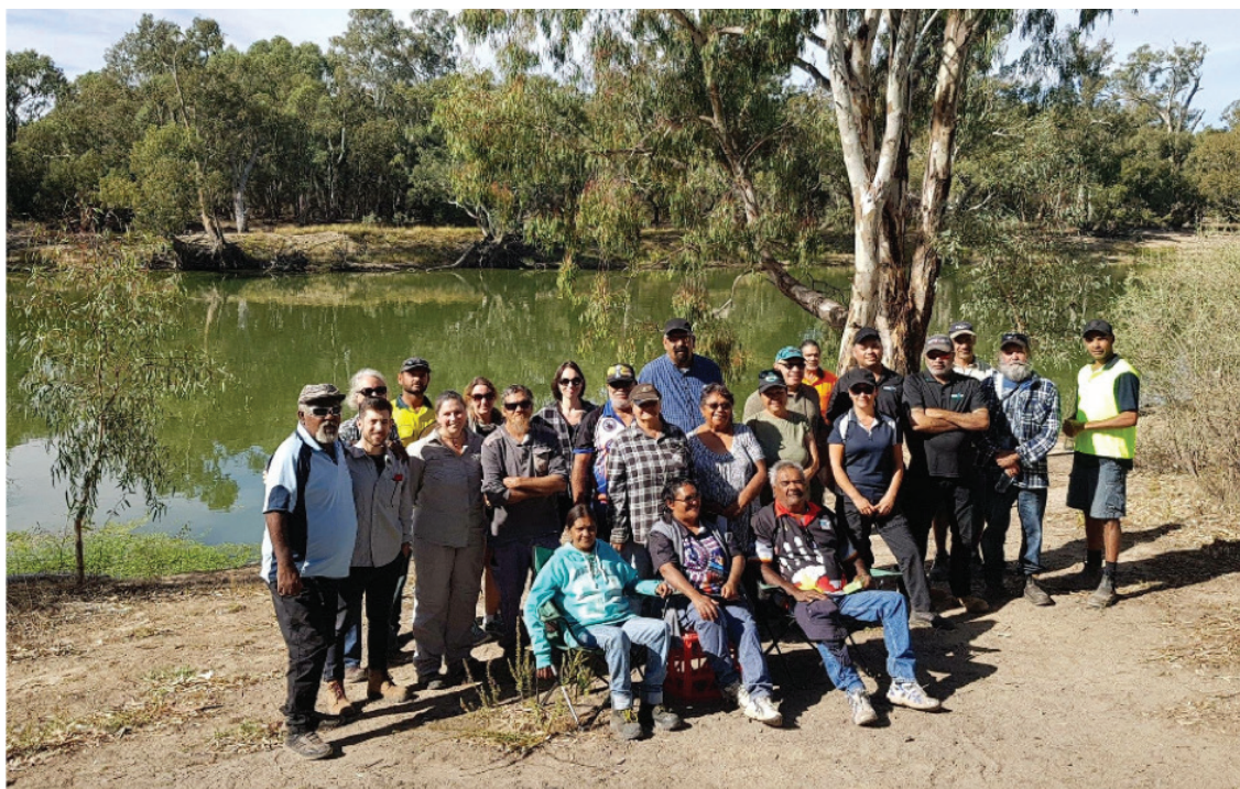
Figure 6: Ngintait Nation Aboriginal Waterway Assessment 2018