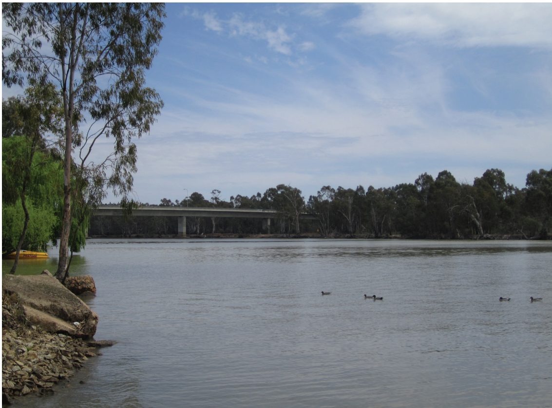
Figure 14: Murray River at Robinvale