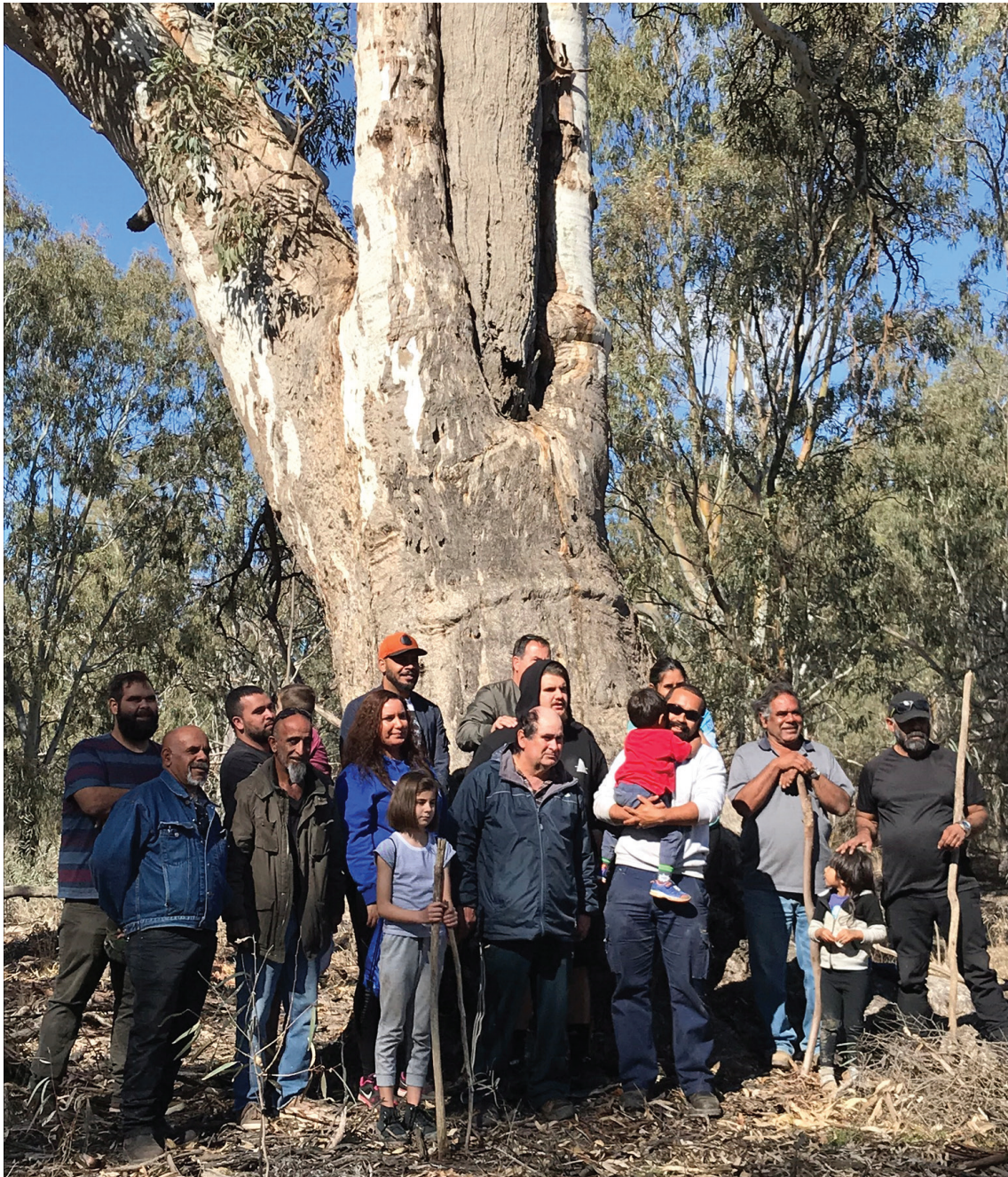
Figure 9: Scar tree near Margooya Lagoon (Tati Tati Wadi Wadi workshop)