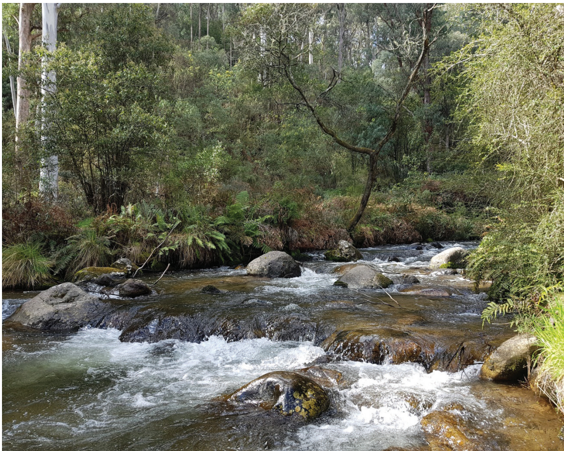
Figure 5: Mountain Creek

The Dhudhuroa, Waywurru and Yaitmathang contribution was signed off by the Board of Directors of the Dhudhuroa Waywurru Nations Aboriginal Corporation.