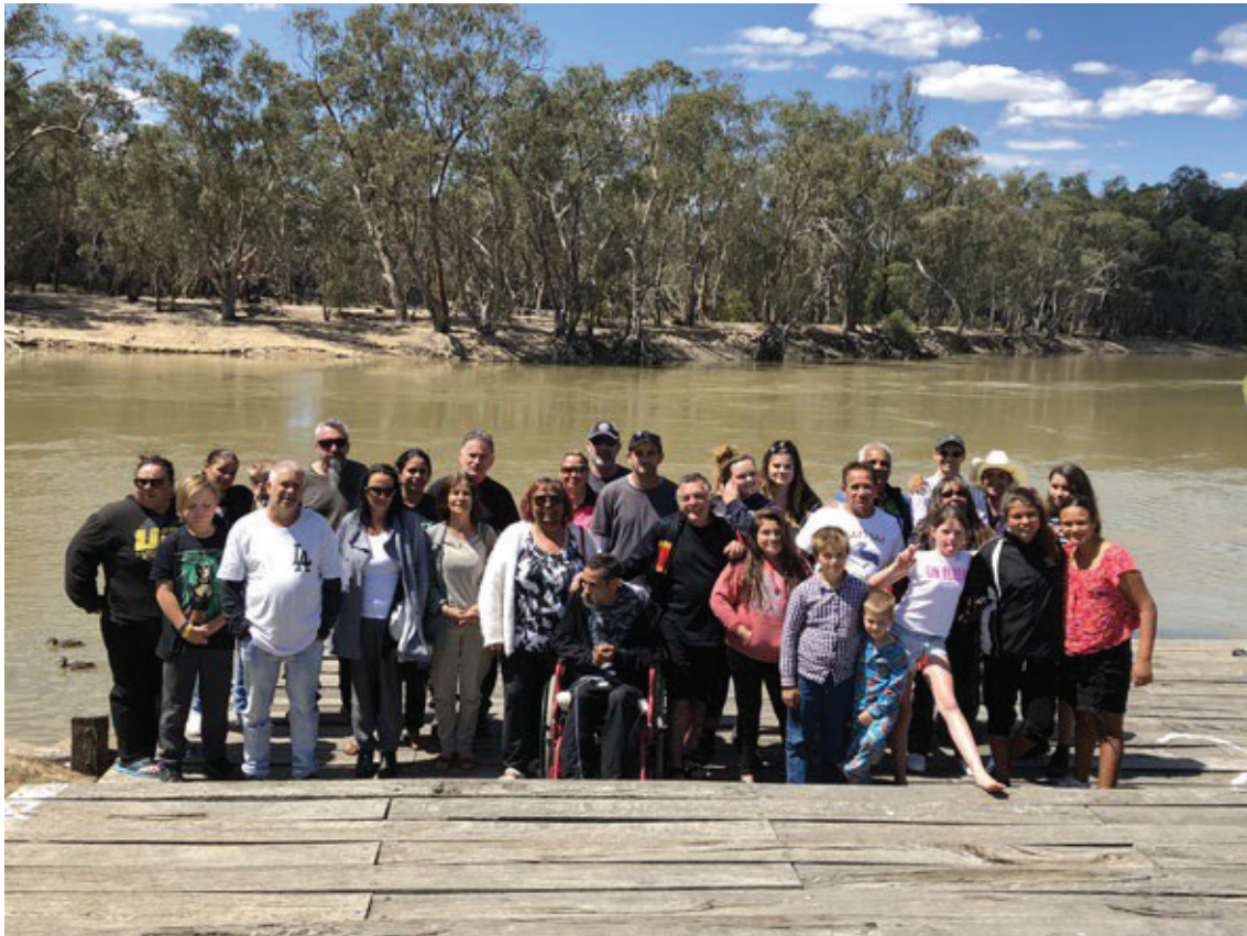
Figure 13: Wadi Wadi workshop participants on the Murray River in Swan Hill

There are a group of Traditional Owners who identify as Tati Tati Wadi Wadi. Please refer to a separate contribution at Section 2.1.6 .