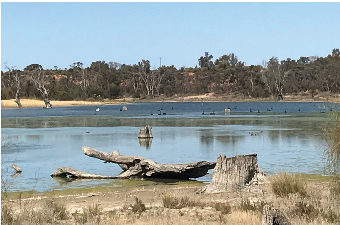
Figure 8: Cowanna and Brickworks billabongs are nationally significant wetlands at Merbein Common