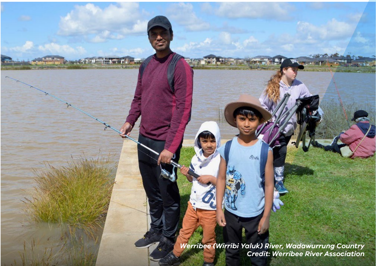
Werribee (Wirribi Yaluk) River, Wadawurrung Country