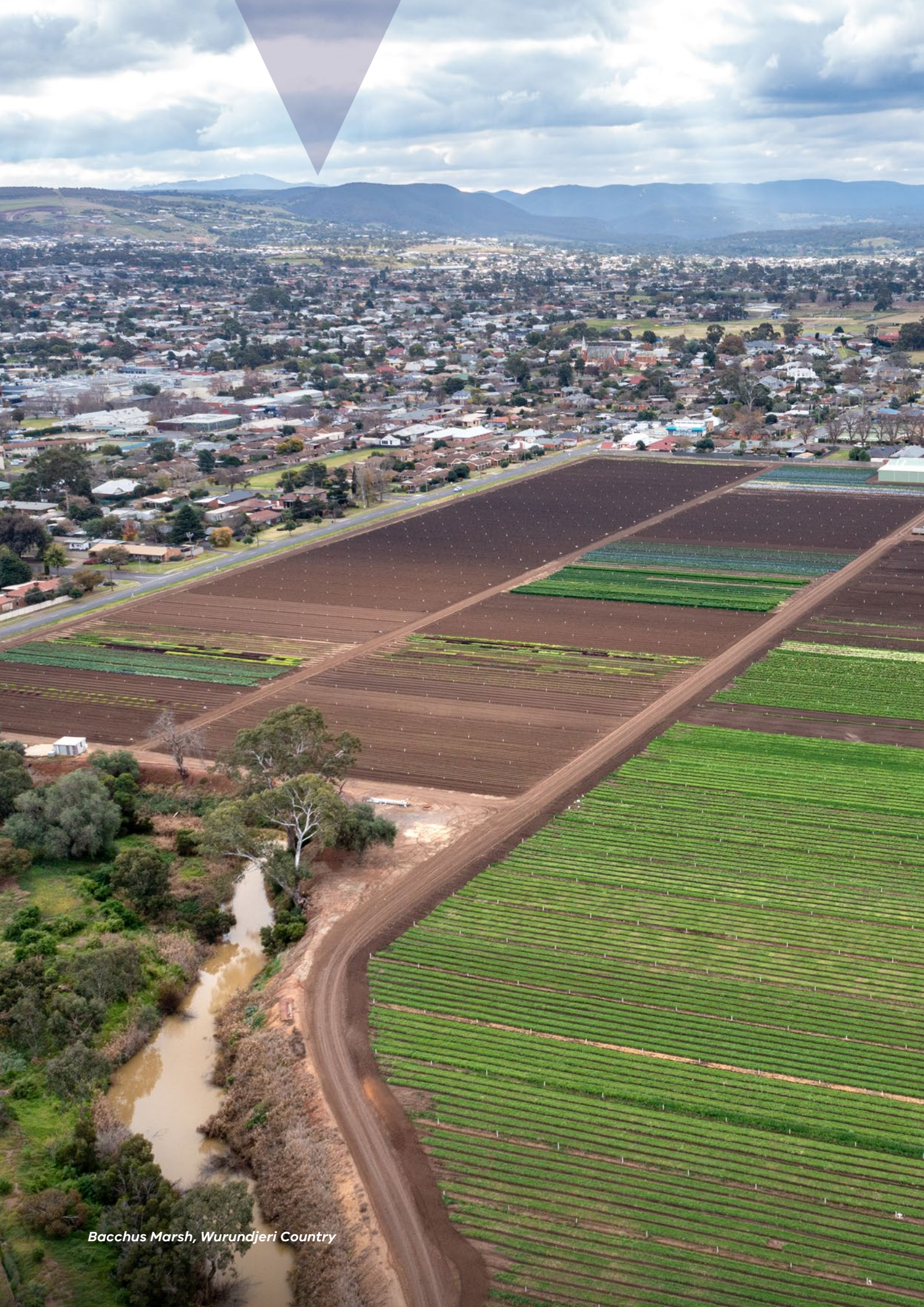
Bacchus Marsh, Wurundjeri Country