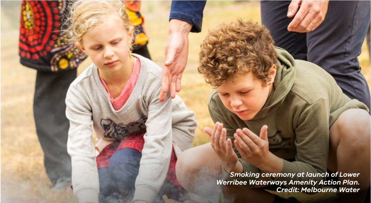
Smoking ceremony at launch of Lower Werribee Waterways Amenity Action Plan.