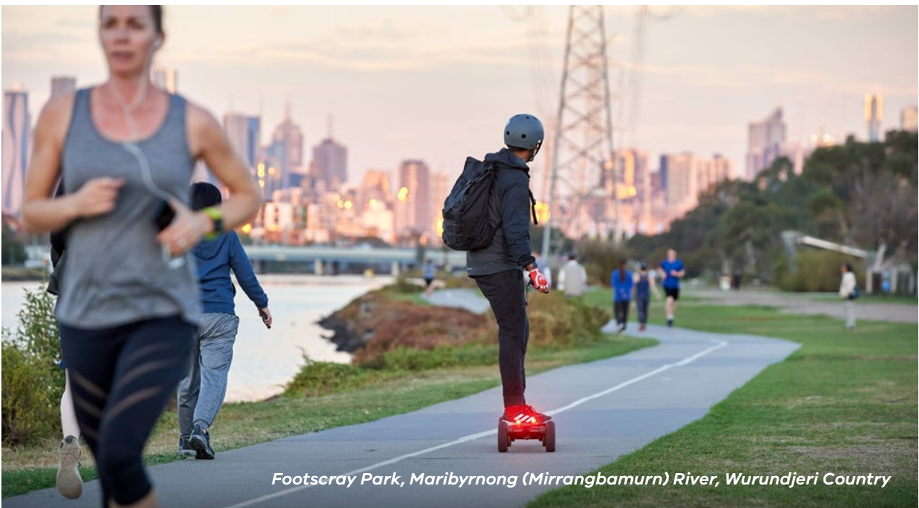
Footscray Park, Maribyrnong (Mirrangbamurn) River, Wurundjeri Country

Also released in September 2022, CGRSWS sets out actions to secure the region’s long-term water supplies. The Waterways of the West and CGRSWS provide pathways for addressing the future needs of the region’s growing population in the face of declining water availability. The strategies look at building resilience through improved management and utilisation of fit for purpose manufactured water sources such as stormwater and recycled water. CGRSWS identifies clear policies and actions for securing additional water for environmental and cultural water returns for key waterways, including for Werribee ( Wirribi Yaluk ) River and Maribyrnong ( Mirrangbamurn ) River, as strongly advocated by the Bunurong, Wadawurrung and Wurundjeri Woi wurrung Traditional Owners and the wider community. There is also a complementary focus on protecting water quality in the west’s waterways including managing the nutrient load that runs into Port Philip Bay, a goal supported by the work of the Waterways of the West Pollution Taskforce.