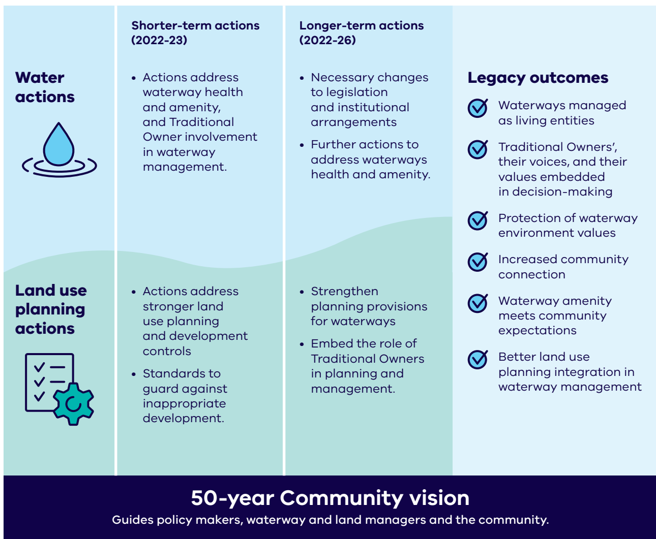
Figure 1: Waterways of the West implementation framework