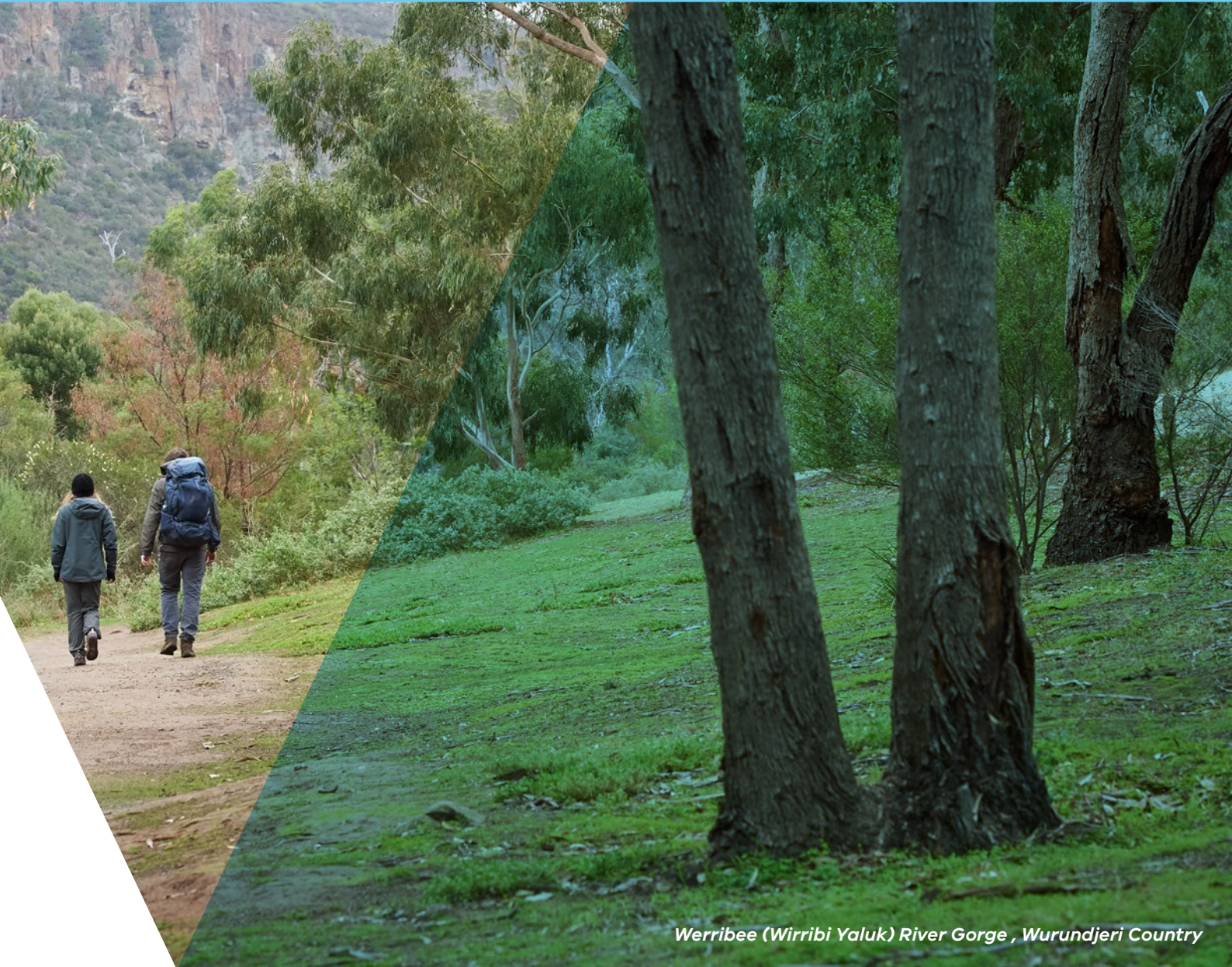
Werribee (Wirribi Yaluk) River Gorge , Wurundjeri Country