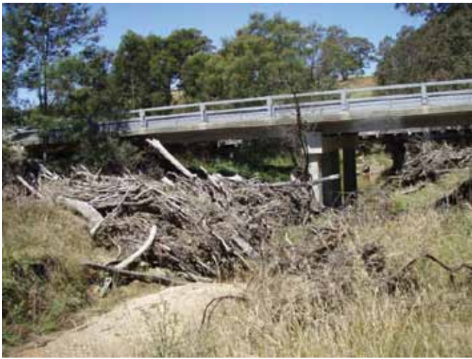
Large wood trapped against a bridge on Sutherland Creek.