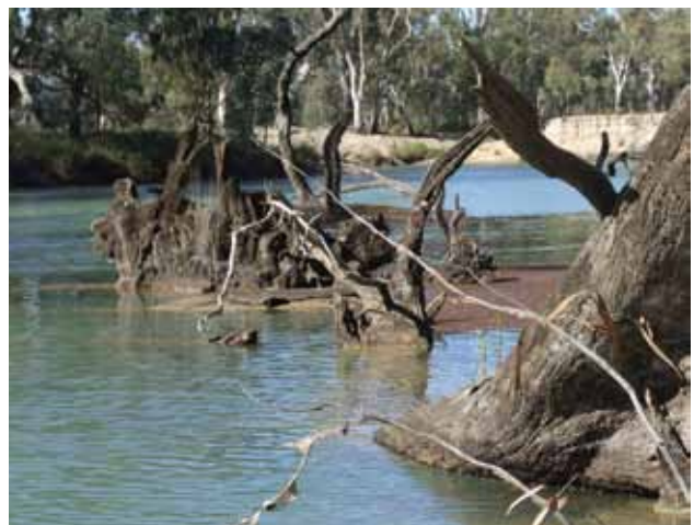
There are benefits for waterway structure and fish habitat in leaving large wood in waterways.

In fact, wood in the river channel can be an important control of bed and bank erosion by resisting and deflecting flows. Past de-snagging has contributed to the degradation of many Australian rivers. In some cases, de-snagging, especially when combined with channelisation, has caused increases in current velocity. This can increase bank and bed erosion, especially in sandy-bed rivers. De-snagging and channelisation have also contributed to increased sedimentation and more severe flooding of downstream reaches.