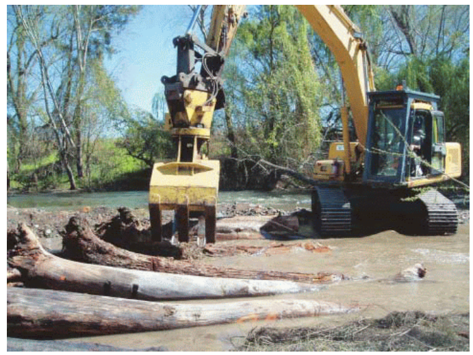
Large wood being anchored into a waterway.