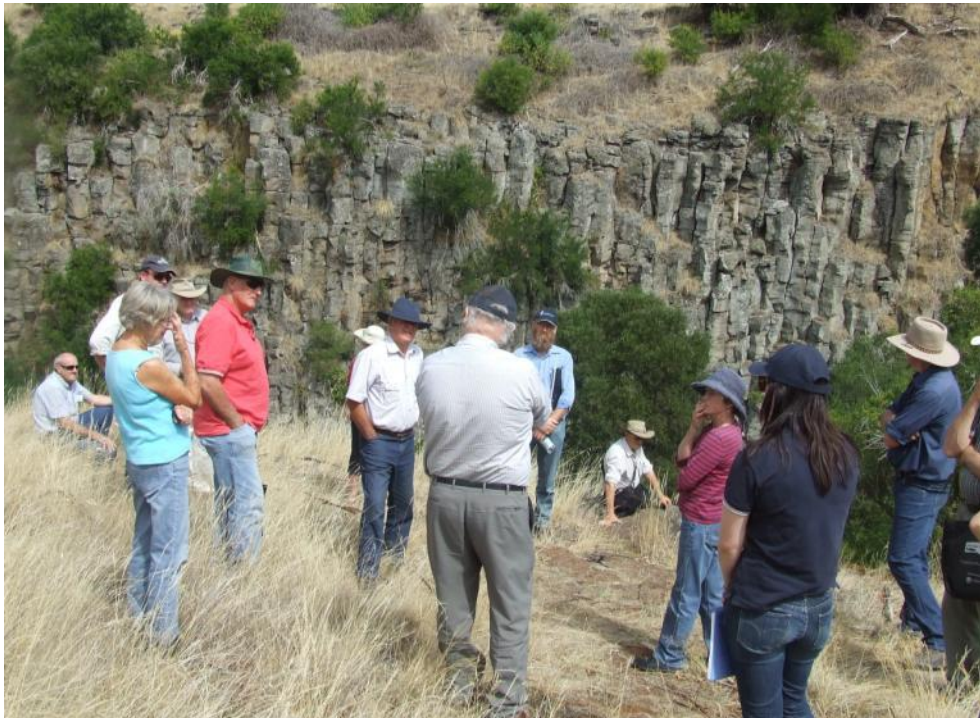
River Advocates Tour 1 at Loddon Falls