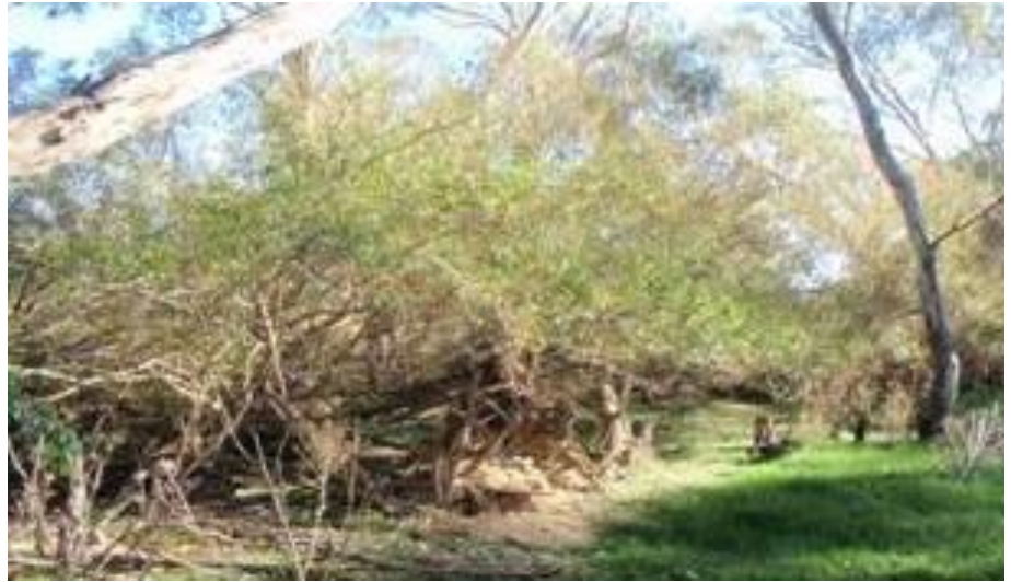
Willow infestation within the stream channel; changing the river's flow pattern.

There will be many benefits from restoring this degraded site on the Loddon, improving both the hydrology and stabilisation of the river bed and banks. The on-ground works will benefit water quality over time by reducing the sediment load available in the river, improving downstream vegetation health and restoring the natural course of the river.