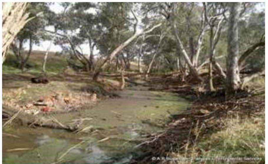
Post willow removal, what a difference!