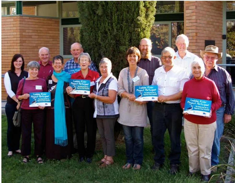
River Advocates at the Serpentine workshop

The next step for the River Advocates network is to develop an online forum, in which the knowledge, stories, historical accounts and photographs can be recorded and shared with the wider community.