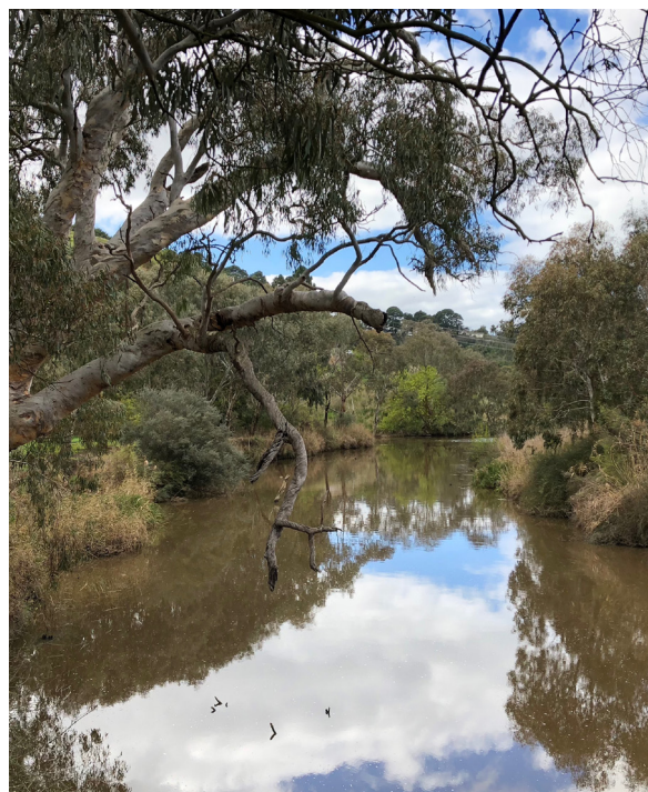
Barwon River, Geelong.

Other policy areas that will require a renewed focus under a new Strategy include climate change and climate adaptation (particularly under a drying climate and sea level rise) and reference to the new Climate Change Act 2017 , floodplain ecology and waterway connectivity between wetlands and floodplains, management of wetlands on private land and a more effective long-term approach for managing estuary mouth openings and protecting estuarine health.