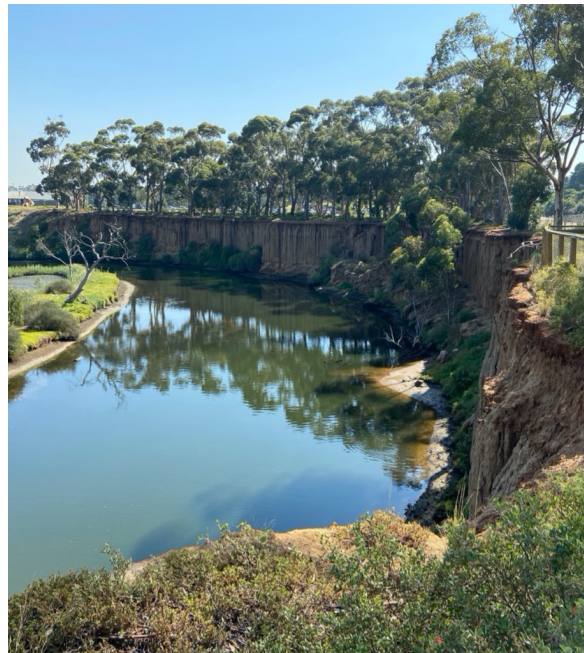
Lower Werribee River.

Overall, the review has been overwhelmingly positive, with an emphasis on minor Strategy improvements rather than wholesale change. The Strategy remains the only statewide waterway strategy of its type in Australia.