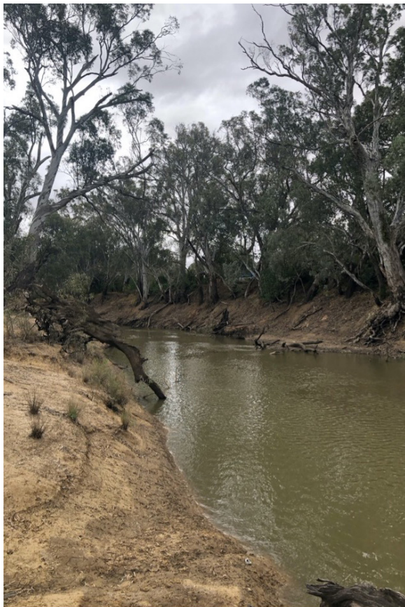
Campaspe River at Echuca.

The following elements of the Strategy were particularly well delivered across each region of Victoria: community engagement, regional priority and target setting, and management action planning. However, adaptive management could have been improved at state and regional levels to allow for new information, new policy directions and unanticipated issues to be better managed over the course of the eight years.