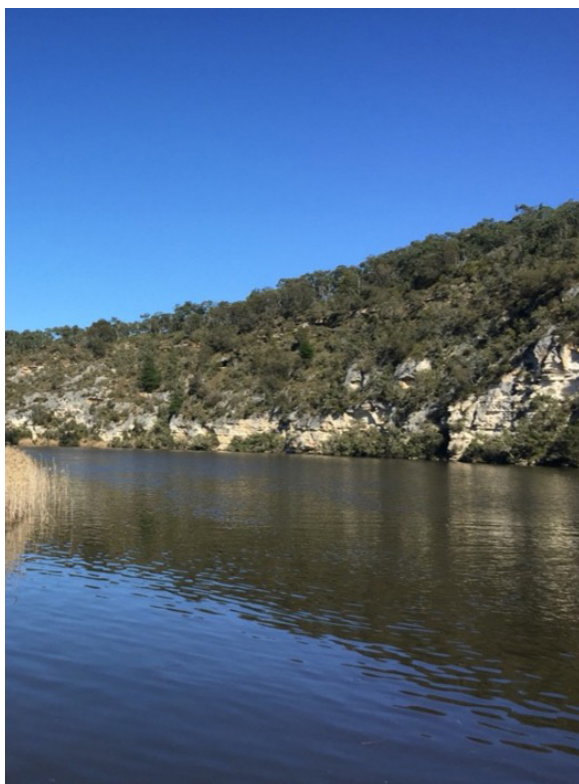
Lower Glenelg River.

The momentum built through the significant work undertaken by DELWP and waterway managers in recent years in the development of more robust target setting and intervention monitoring programs at a series of 'flagship' waterways should be continued. This should be supported through a renewed focus on appropriate capacity building and knowledge exchange opportunities aimed at the current and next generation of water and catchment management professionals.