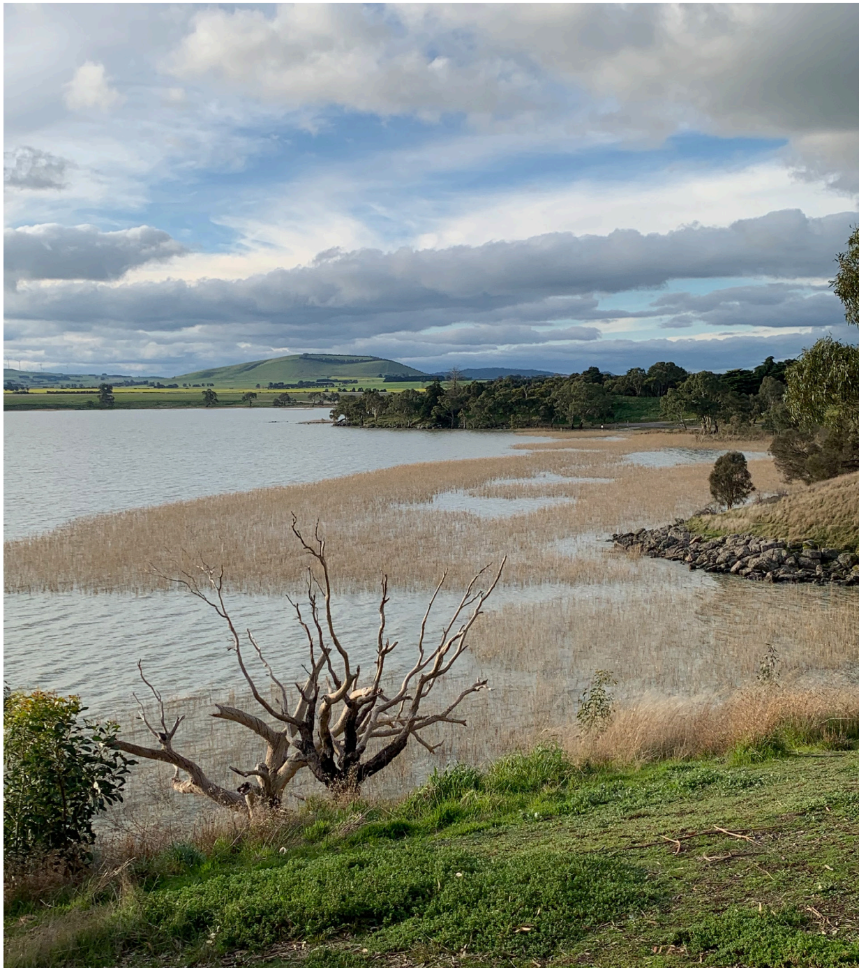
Lake Burrumbeet.

RMCG thanks all those who contributed to the Victorian Waterway Management Strategy Independent Review via participation in workshops, interviews and/or the online survey. This includes many staff from across DELWP, CMAs, Melbourne Water, other Victorian government agencies, peak bodies and other organisations involved in the design or delivery of the Strategy.