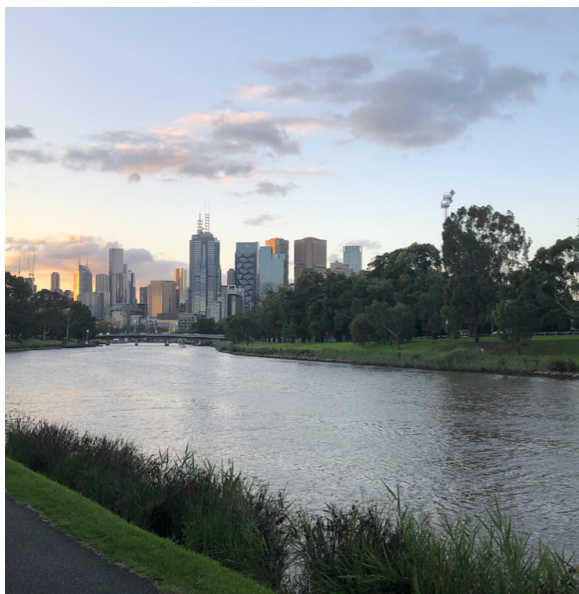
Yarra River, Melbourne.

The independent review is a key activity in the evaluation and reporting stage of the Strategy's eight-year adaptive management approach. It provides an opportunity to review the implementation of policy directions and actions, reflect on key learnings, and consider advances in policy, legislation and knowledge since the current Strategy commenced. The review is also a requirement of the Strategy (Action 17.11).