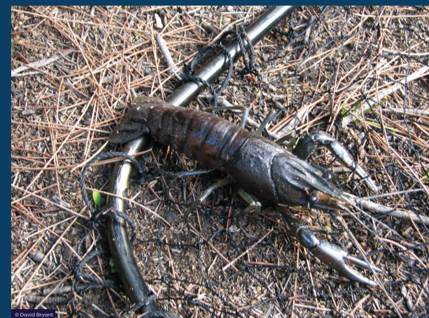
Smooth Marron Cherax cainii and Hairy Marron Cherax tenuimanus#