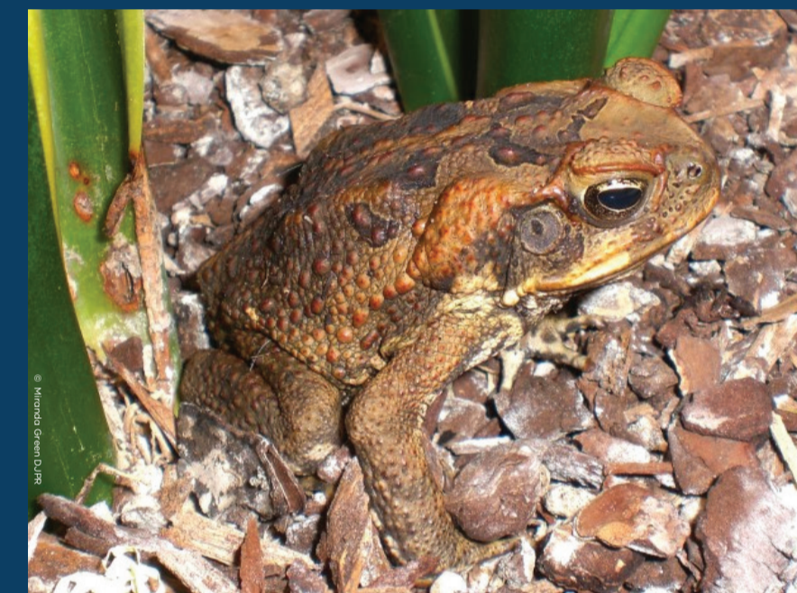
Cane Toad Rhinella marina ‡Prohibited pest animal