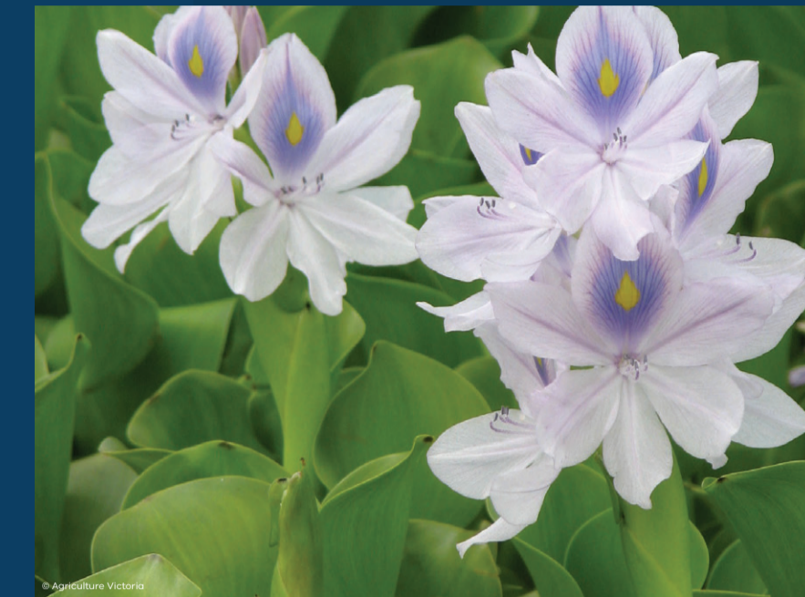
Water Hyacinth Eichhornia crassipes*