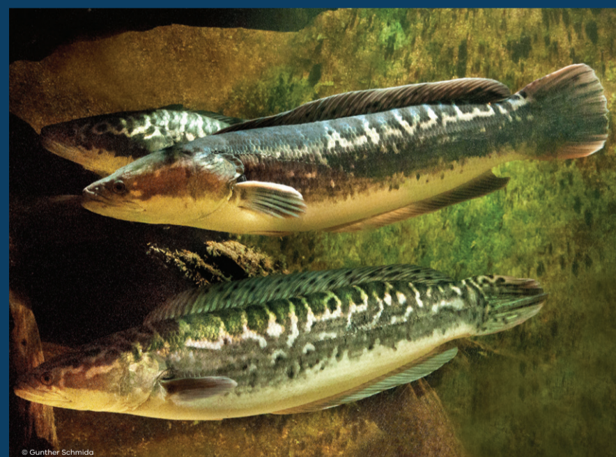
Snakehead Channa species#