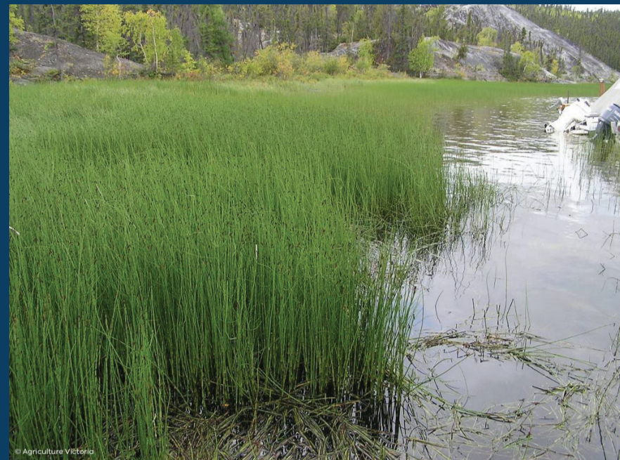
Horsetails Equisetum species*