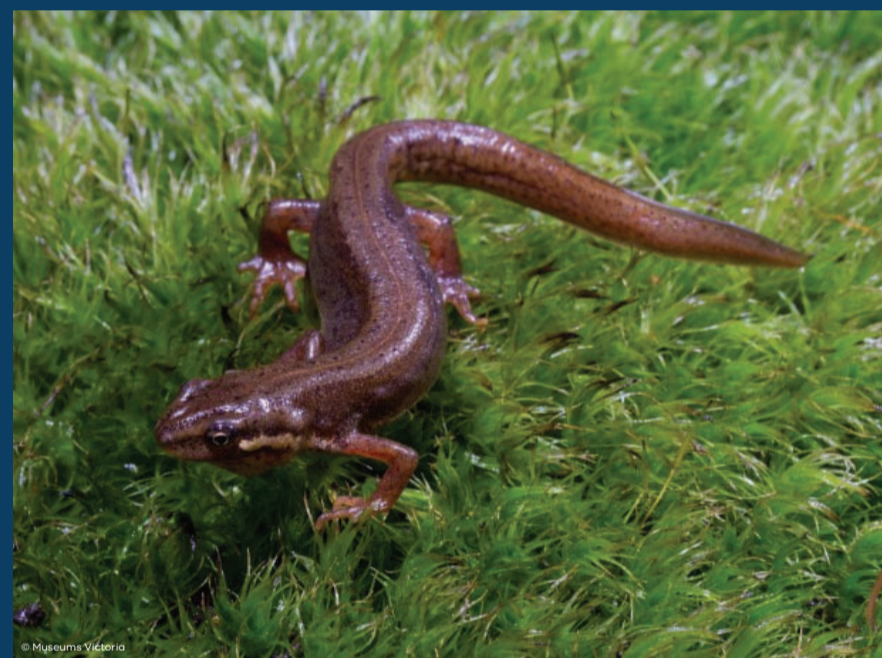
Smooth Newt Lissotriton vulgaris ‡Prohibited pest animal