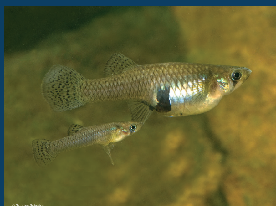
Eastern Gambusia Gambusia holbrooki# Since widely established, please report if found outside its known location.