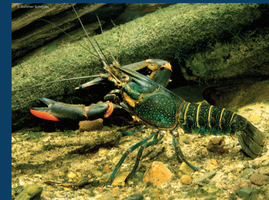
Red Claw Crayfish Cherax quadricarinatus#