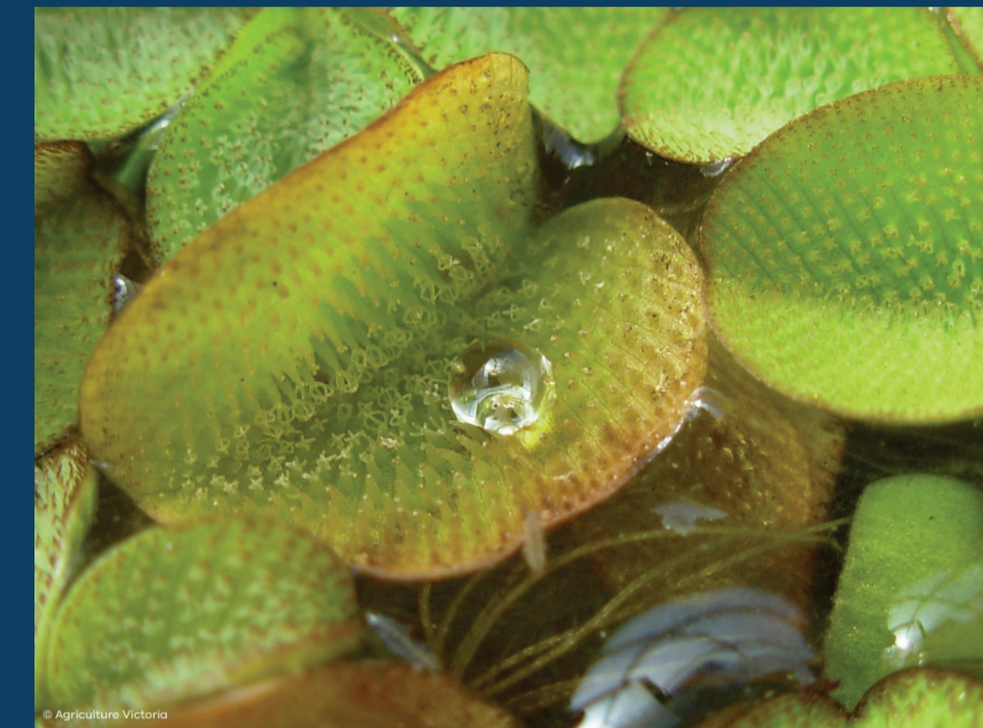
Salvinia Salvinia molesta*