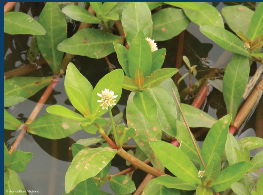
Alligator Weed Alternanthera philoxeroides*