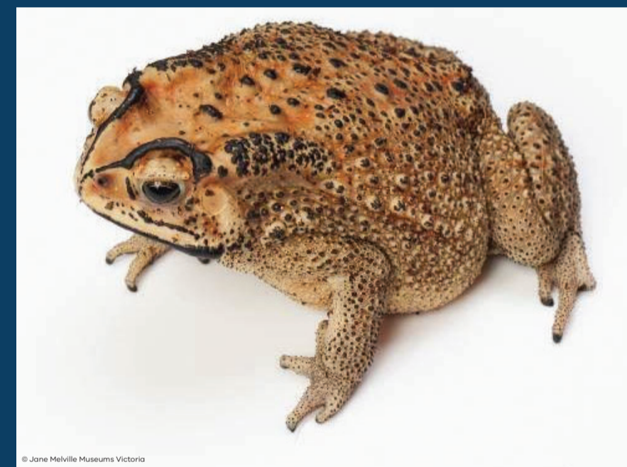
Asian Black-spined Toad Duttaphrynus melanostictus ‡Prohibited pest animal