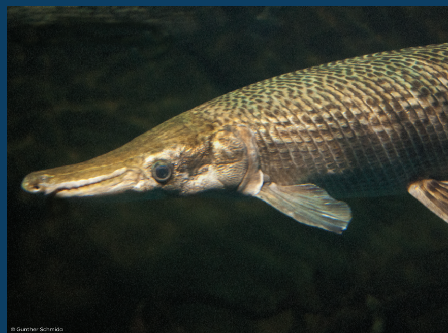
Alligator Gar Atractosteus species#