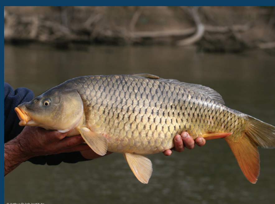
Common Carp Cyprinus carpio# Since widely established, please report if found outside its known location.