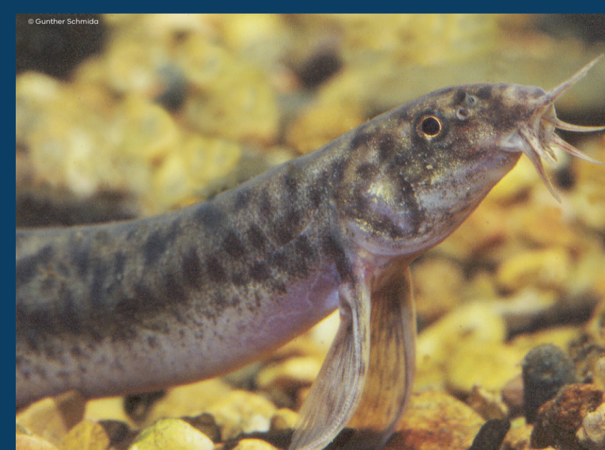
Oriental Weatherloach Misgurnus anguillicaudatus#