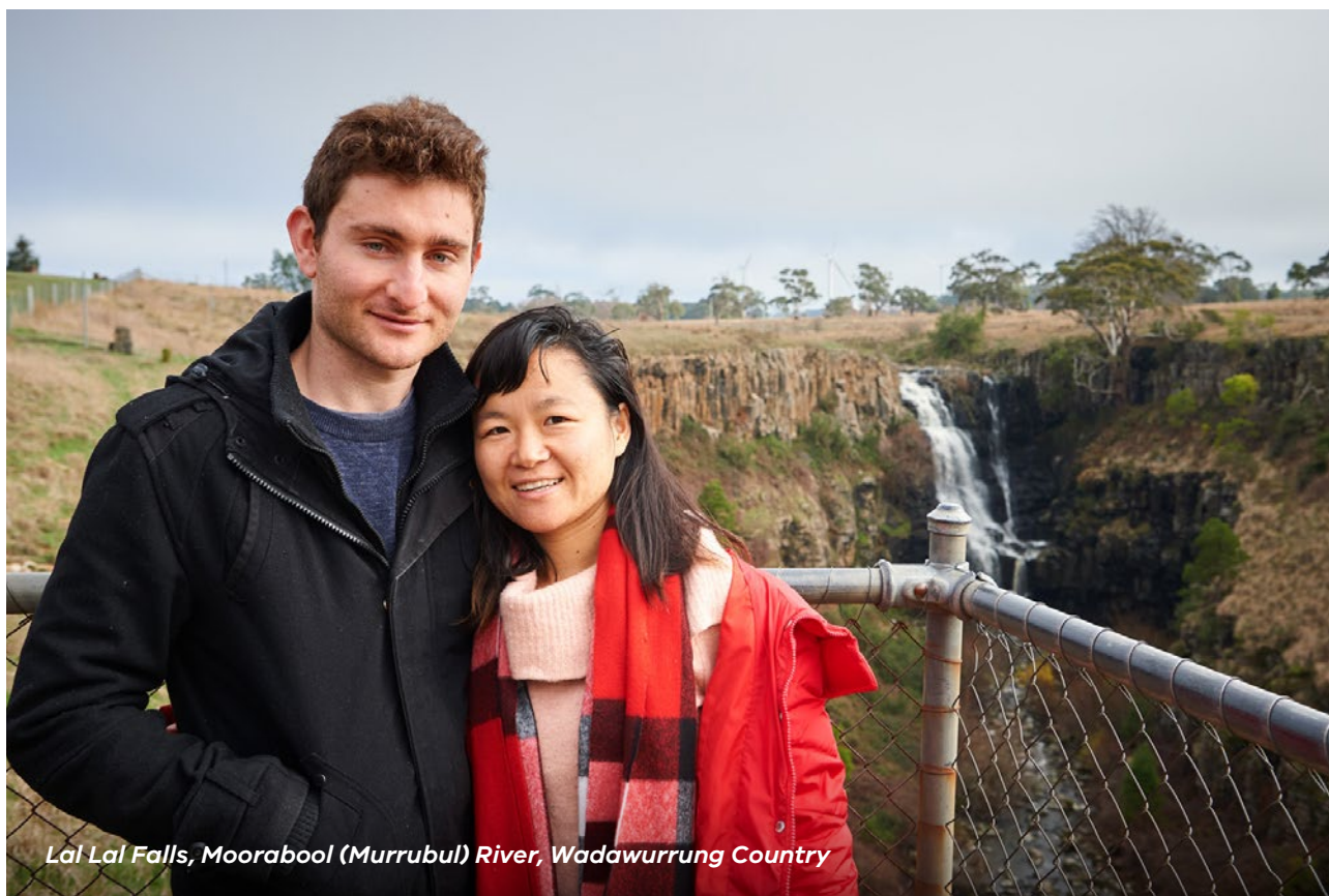
Lal Lal Falls, Moorabool (Murrubul) River, Wadawurrung Country

#CCMA - Corangamite Catchment Management Authority; DEECA - Department of Energy, Environment and Climate Action; and DTP – Department of Transport and Planning.