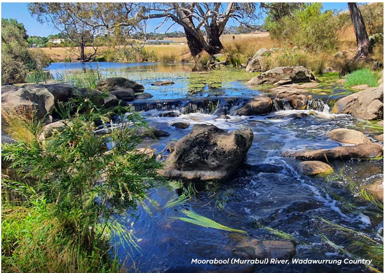
Moorabool (Murrabul) River, Wadawurrung Country

Also released in September 2022, the CGRSWS identifies clear policies and actions to secure the region’s long-term water supplies. It defines actions for obtaining additional water for environmental and cultural returns for key waterways, including for the Moorabool ( Murrabul ) River. It also sets policy directions and provides tangible actions to achieve outcomes for sustainable water management. Implementation of the CGRSWS will involve working with Eastern Maar and Wadawurrung Traditional Owners to determine how returned water will be shared between the environment and Traditional Owners.