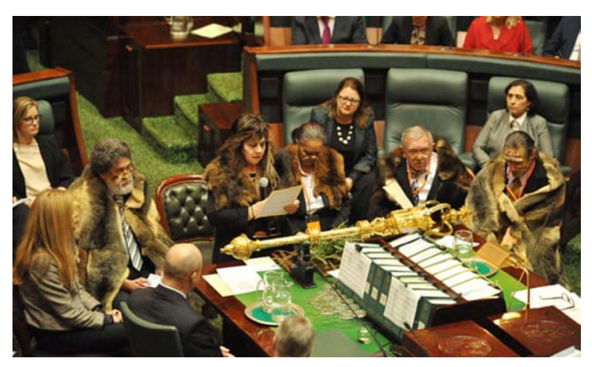
The historic moment in June 2017, prior to the introduction of the Yarra River Protection (Wilip-gin Birrarung murron) Bill when Wurundjeri Woi-wurrung Elders adressed the Victorian Parliament in English and Woi-wurrung language.

Given the frame of its enabling legislation, the Birrarung Council functions as a bi-cultural body. In order to do this, non-Indigenous members work with the Traditional Owner members to learn how to look at issues in a different way, to understand the Custodian's perspective on care for and connection to Country. We aim to build a collective Council understanding of Wurundjeri Woi-wurrung appreciation of the River and its corridor. This is an ongoing learning process.