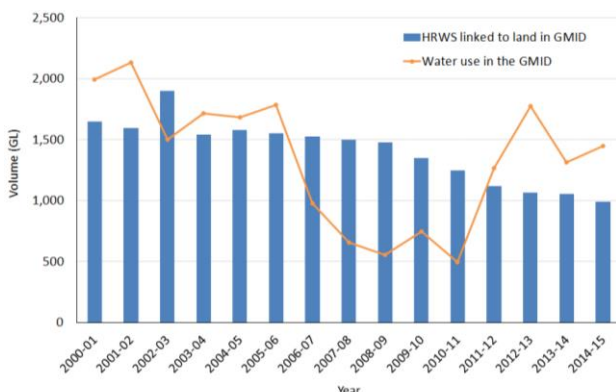
Figure 1: High Reliability Water Shares linked to land and water use in the GMID