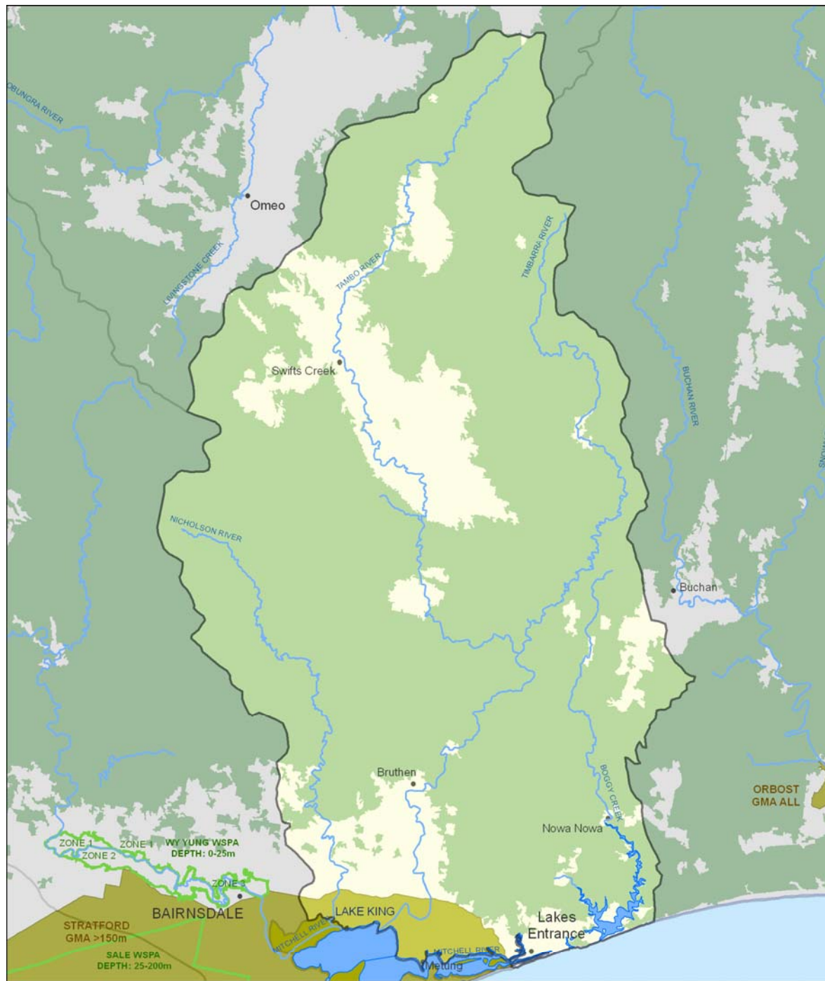
Figure 18-1 Map of the Tambo basin